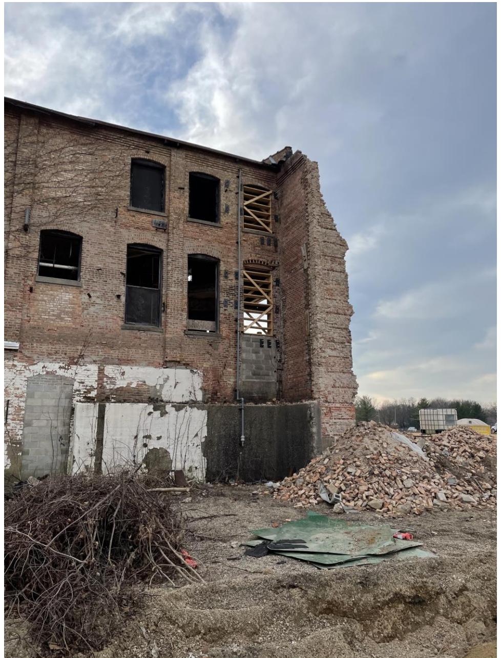
North Wall of Building 2 Looking South