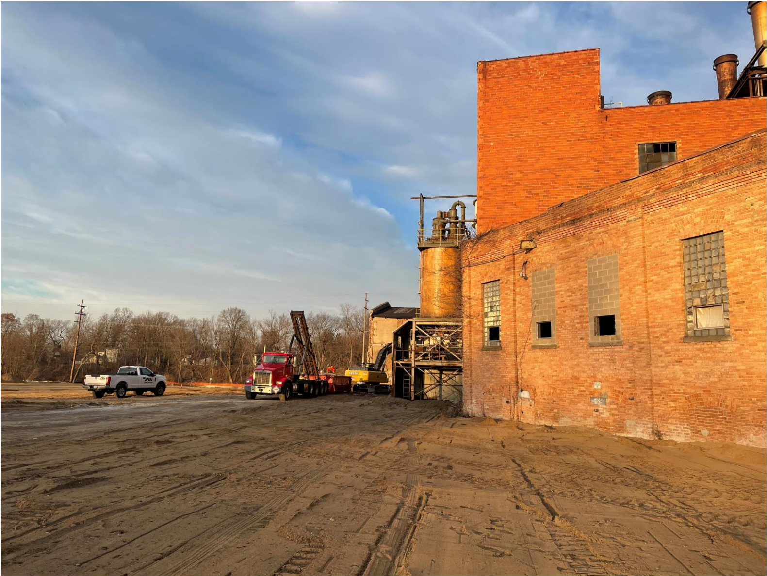
The City of Plainwell is an equal opportunity provider and employer