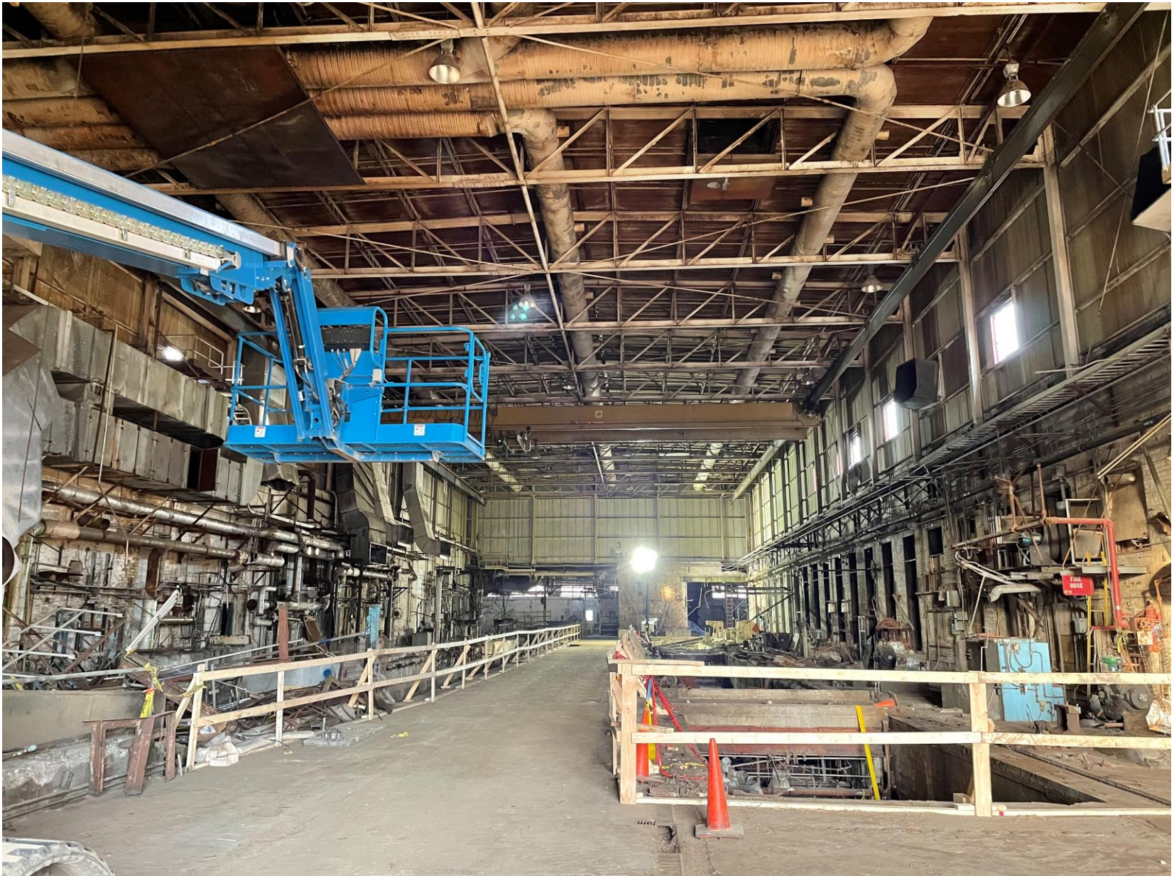
The City of Plainwell is an equal opportunity provider and employer