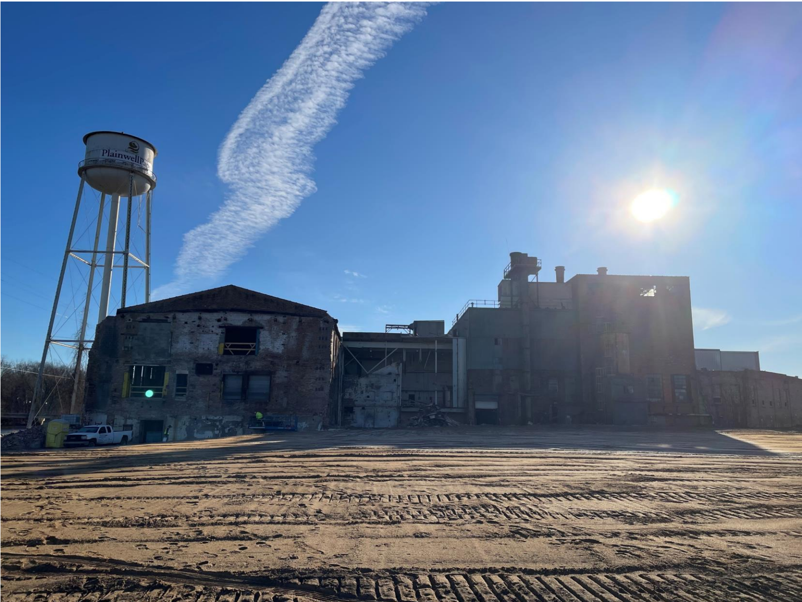
The City of Plainwell is an equal opportunity provider and employer