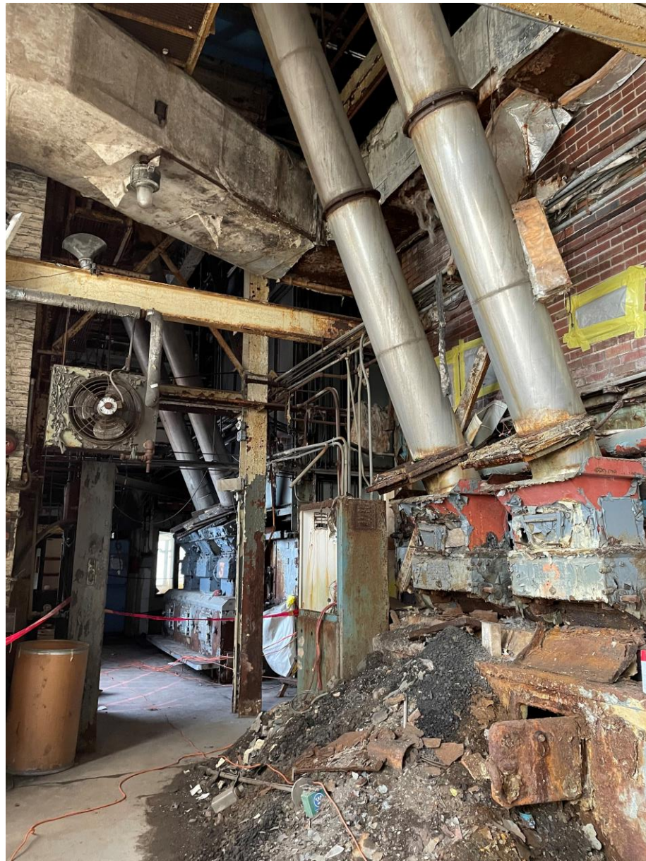
Existing Boiler Room