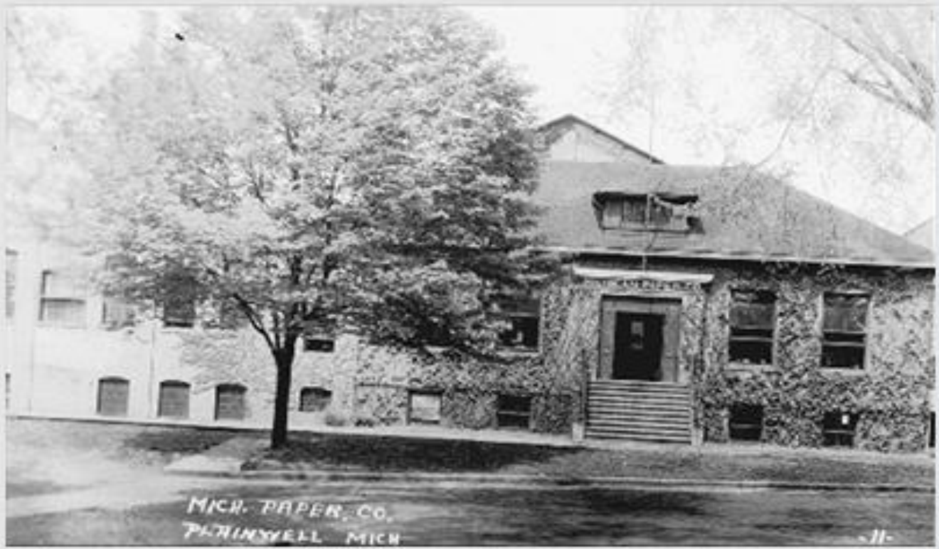
Then and Now